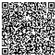
QR Code for donations