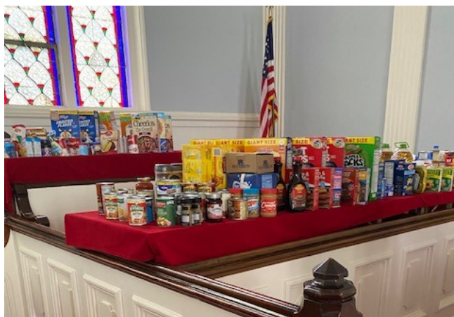
The array of food items donated by the congregation and collected for the Food for Friends Food Pantry during the month of June.

The Food Pantry is open every Monday and Friday throughout the year to take care of the nutritional needs of over 600 families per week. Our church has faithfully collected canned and boxed items to support the pantry since 2000.